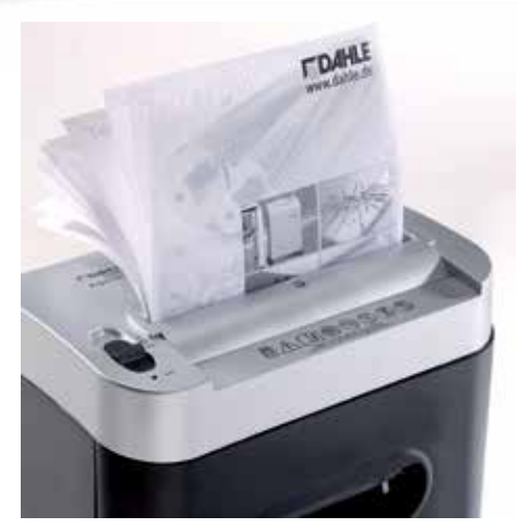
Paper easily feeds in sizes up to A5