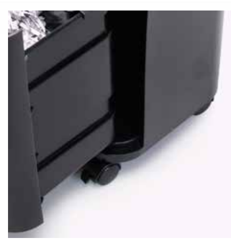
Practical swivel casters for flexible use