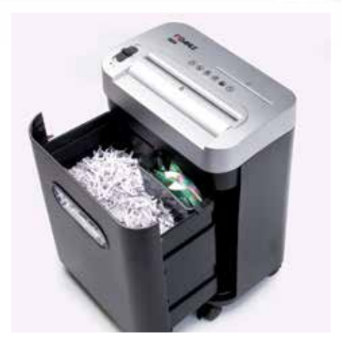
Separate, integrated waste box for sorting shredded paper and CDs, DVDs, cheque cards and credit cards for environmentally friendly recycling