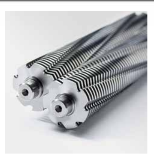
High-quality, solid-steel cutters in special steel for a guaranteed long service life