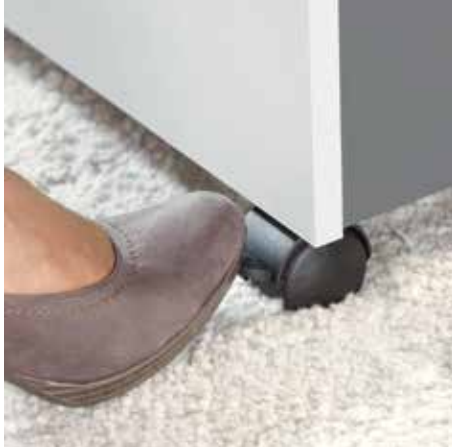
Convenient swivel casters providing 5 cm floor clearance for greater mobility and two brakes for reliably keeping the shredder firmly in place at the point of use