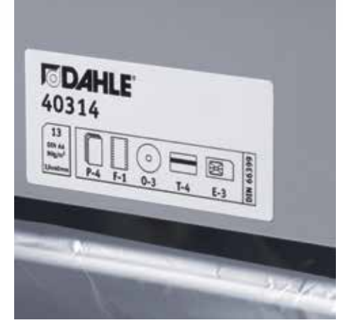
Clearly labelled performance characteristics on the top of the shredder help to ensure correct document shredder operation