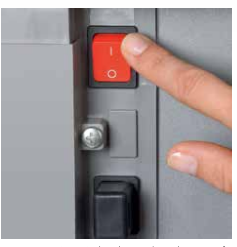
Separate main switch is located on the rear of the document shredder and completely disconnects it from the mains power supply