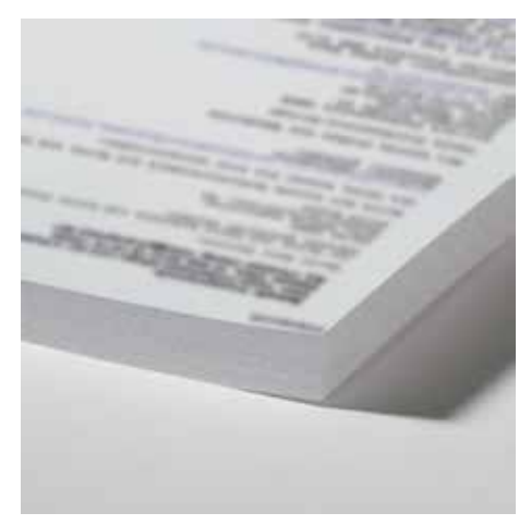
High shredding capacity makes easy work of shredding larger quantities of paper in one go

Pull-out rounded top frame that's kind on the fingers when changing the waste bag