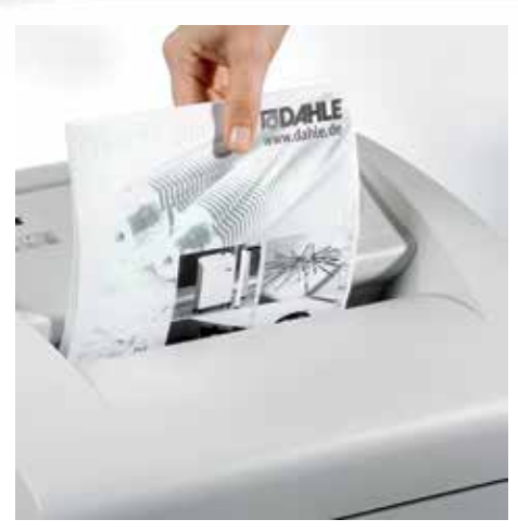
Standardised entry widths take all common paper sizes