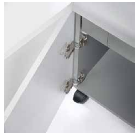
Wide opening door to easily empty the waste bag