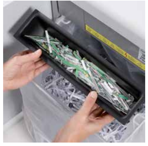
Separate, integrated waste boxes help to sort shredded paper, CDs, DVDs, cheque and credit cards for eco-friendly recycling