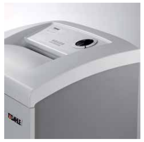
Modern design blends into any working environment.