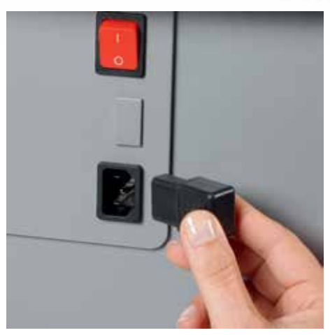
Detachable IEC power plug makes the document shredder quick and easy to move from A to B