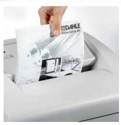
Standardised entry widths take all common paper sizes