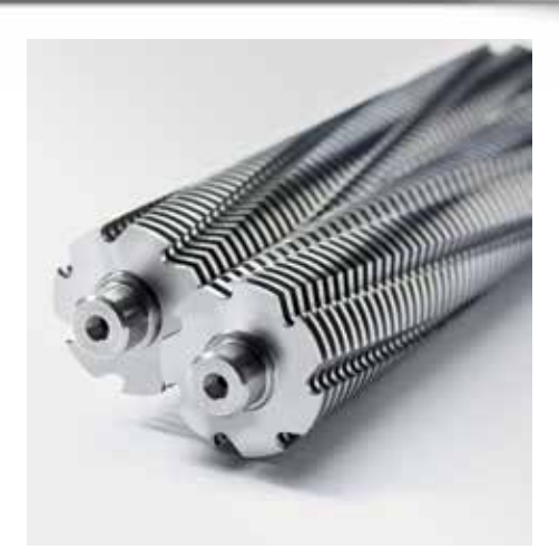
High-quality, solid-steel cutters in special steel for a guaranteed long service life