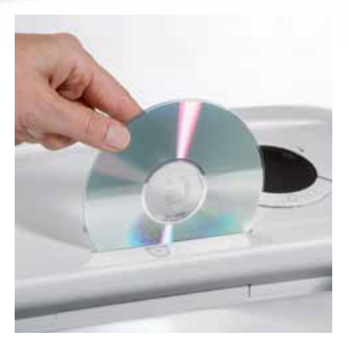
Separate feed opening for CDs, DVDs, cheque and credit cards guarantees reliable shredding of optical, magnetic and/or electronic data carriers