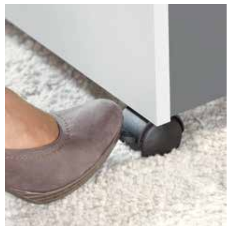
Convenient swivel casters providing 5 cm floor clearance for greater mobility and two brakes for reliably keeping the shredder firmly in place at the point of use