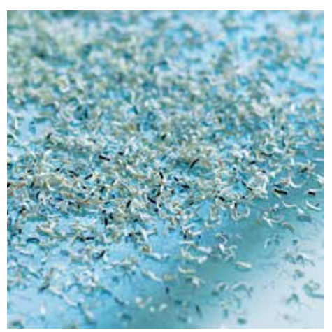
P-7 security: recommended for data media containing top secret data demanding maximum security measures

High-quality, solid-steel cutters in special steel for a guaranteed long service life