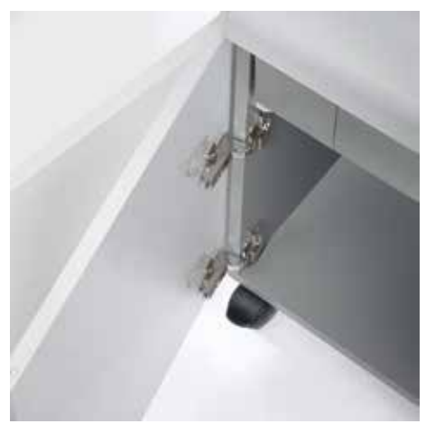
Wide opening door to easily empty the waste bag

High shredding capacity makes easy work of shredding larger quantities of paper in one go