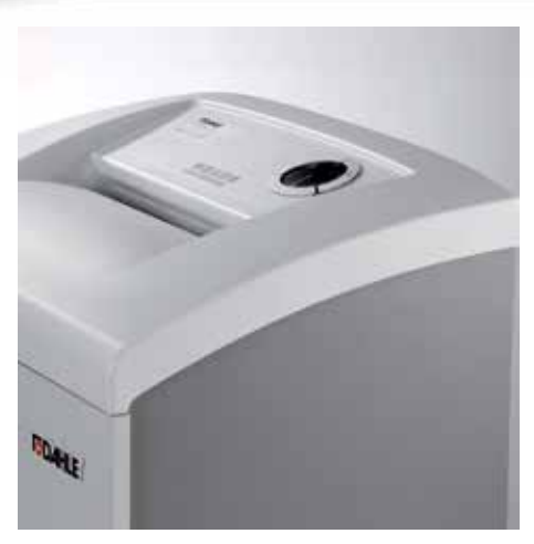
Modern design blends into any working environment.