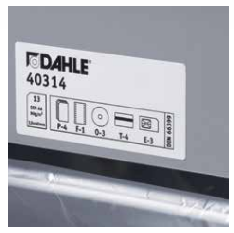
Clearly labelled performance characteristics on the top of the shredder help to ensure correct document shredder operation