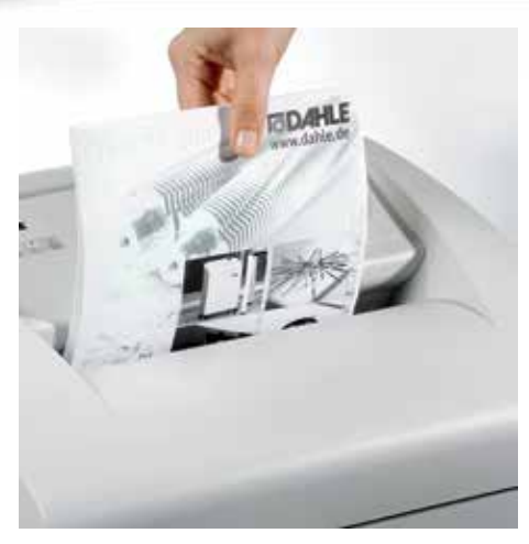
Standardised entry widths take all common paper sizes