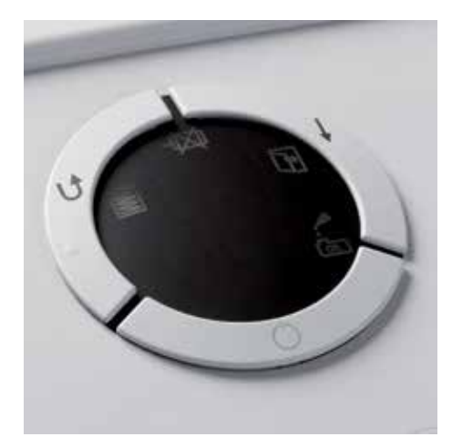
Clearly designed, user-friendly control panel permits easy, self-explanatory operation with illuminated symbols and acoustic signals