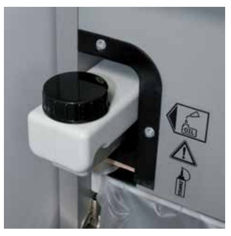
Integrated oil tank for controlled, automatic lubrication of the cross-cut cutters helps to lengthen service life while keeping performance constant