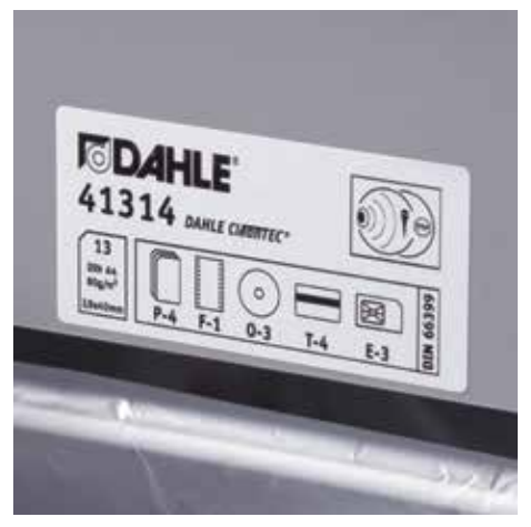
Clearly labelled performance characteristics on the top of the shredder help to ensure correct document shredder operation