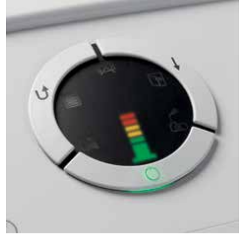
Paper quantity sensors prevent the document shredder from starting if too much has been fed in to avoid paper jams