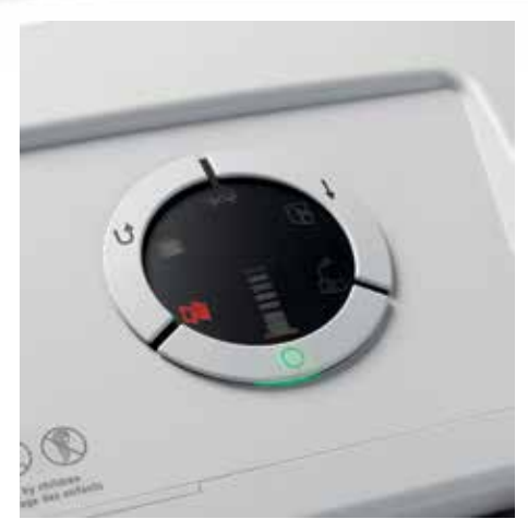
Clearly structured, user-friendly control panel indicates when the fine dust filter needs changing