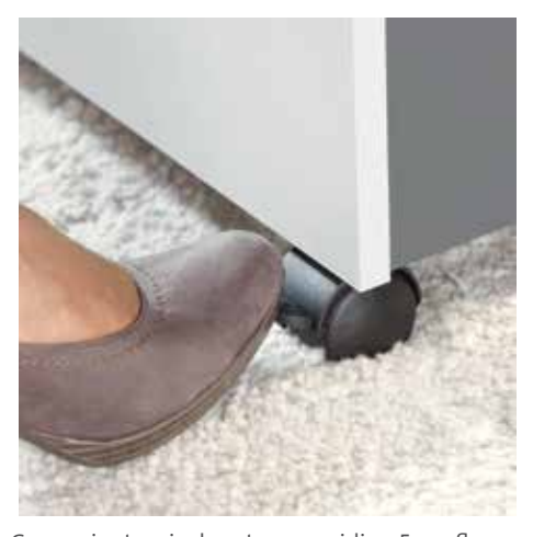
Convenient swivel casters providing 5 cm floor clearance for greater mobility and two brakes for reliably keeping the shredder firmly in place at the point of use