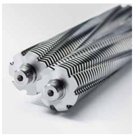
High-quality, solid-steel cutters in special steel for a guaranteed long service life