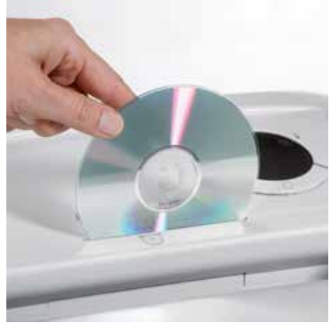
Separate feed opening for CDs, DVDs, cheque and credit cards guarantees reliable shredding of optical, magnetic and/or electronic data