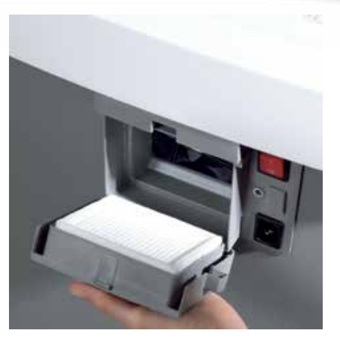
Environmentally-friendly filter is easy to change. A signal on the user-friendly control panel indicates when the fine dust filter needs changing