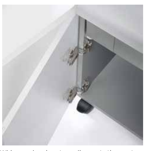
Wide opening door to easily empty the waste bag