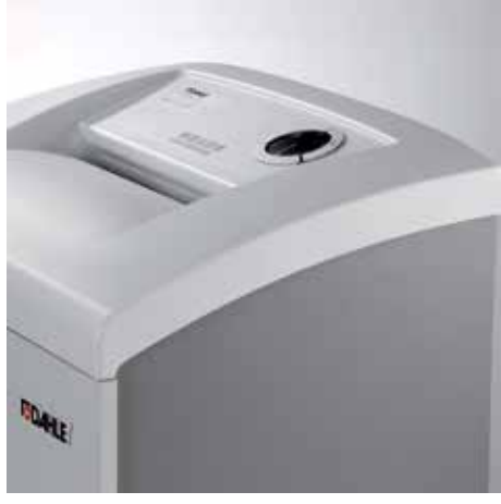
Modern design blends into any working environment.