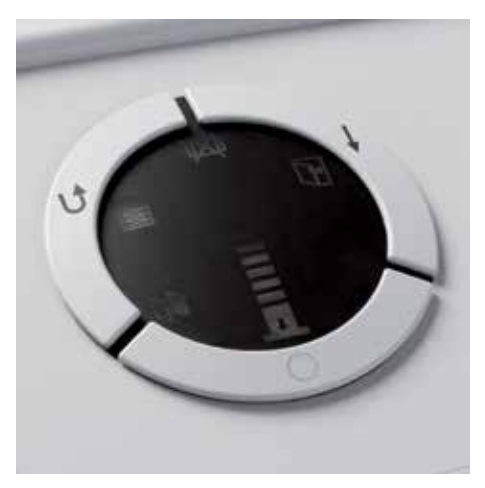
Clearly designed, user-friendly control panel permits easy, self-explanatory operation with illuminated symbols and acoustic signals