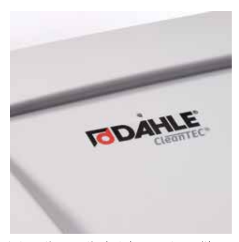
Automatic acoustic shut-down system with integrated microphone immediately stops the document shredder in an emergency in response to a call for help or knocks to the casing,