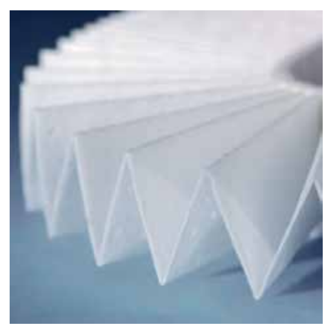
Environmentally friendly filter is made of special 3-ply, fully recyclable non-woven material