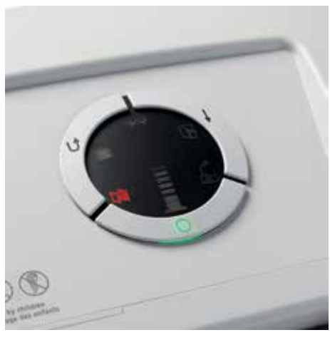
Clearly structured, user-friendly control panel indicates when the fine dust filter needs changing