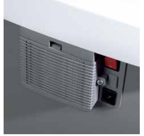
Unique DAHLE CleanTEC® filter system filters and effectively binds fine dust particles to create a better indoor environment.