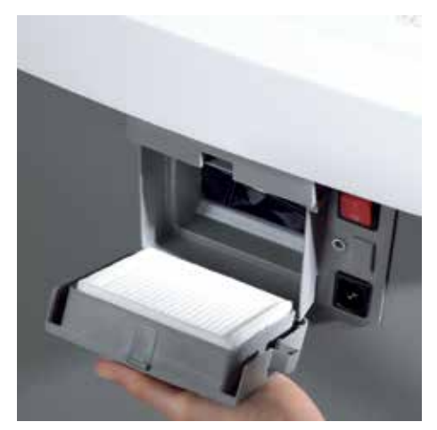
Environmentally-friendly filter is easy to change. A signal on the user-friendly control panel indicates when the fine dust filter needs changing