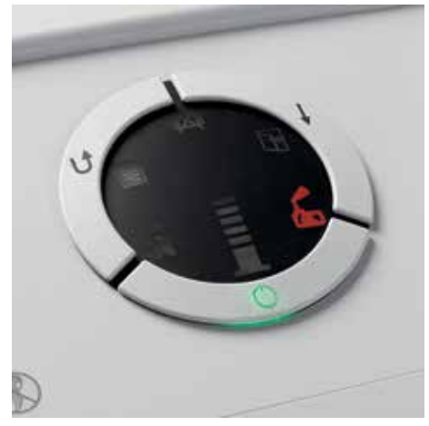
Clearly designed, user-friendly control panel signals oil refill