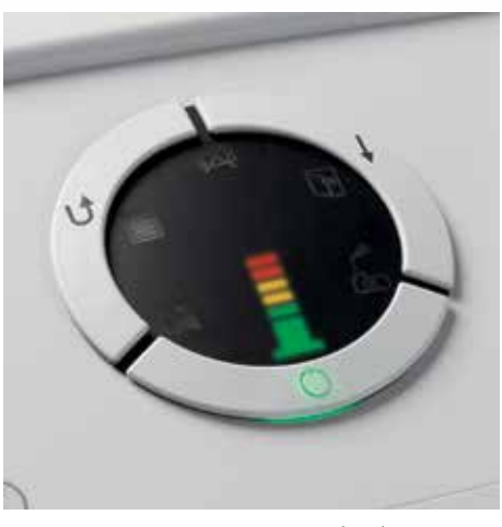
Paper quantity sensors prevent the document shredder from starting if too much has been fed in to avoid paper jams

Automatic acoustic shut-down system with integrated microphone immediately stops the document shredder in an emergency in response to a call for help or knocks to the casing,