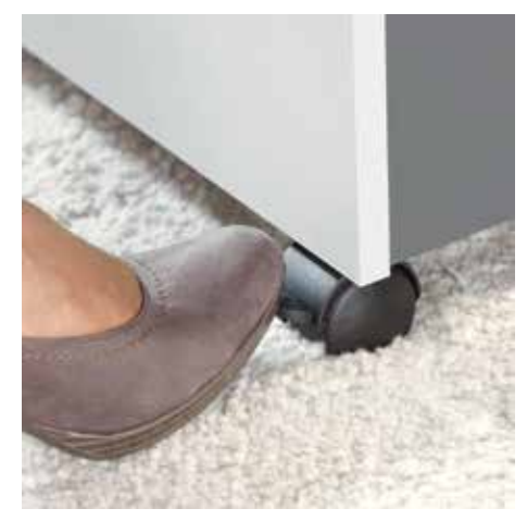
Convenient swivel casters providing 5 cm floor clearance for greater mobility and two brakes for reliably keeping the shredder firmly in place at the point of use