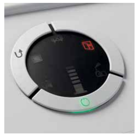
Visual and acoustic signal indicates open door