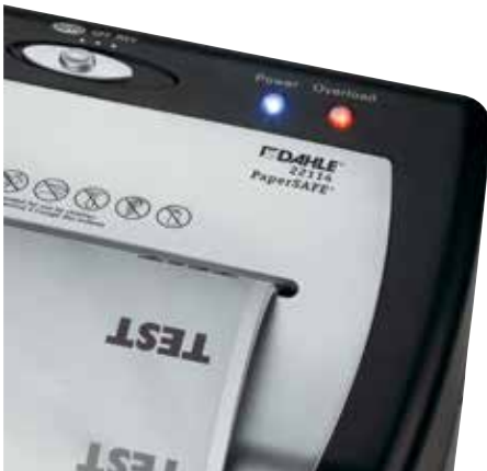
Visual overload indicator shows when too much paper has been fed into the document shredder