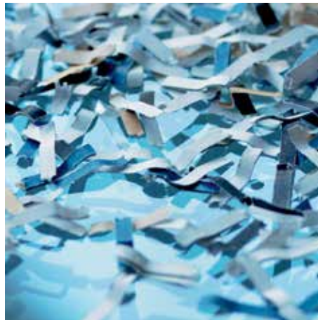
P-3 security: recommended, for example, for data media containing sensitive, confidential and personal data