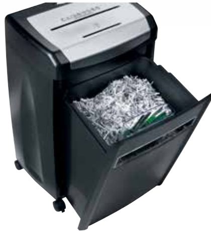
Separate, integrated waste box for sorting shredded paper and CDs, DVDs, cheque cards and credit cards for environmentally friendly recycling