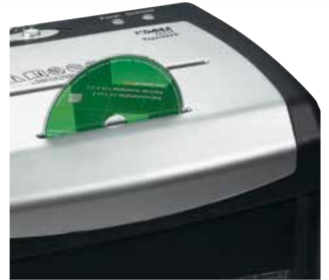
Separate cutters with feed opening for securely shredding CDs, DVDs and cards