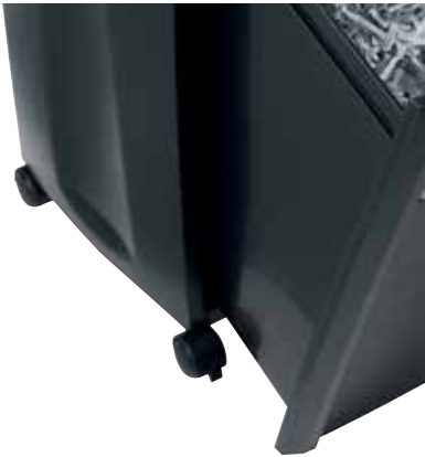
Practical swivel casters for flexible use