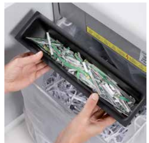
Separate, integrated waste boxes help to sort shredded paper, CDs, DVDs, cheque and credit cards for eco-friendly recycling