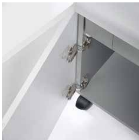
Wide opening door to easily empty the waste bag