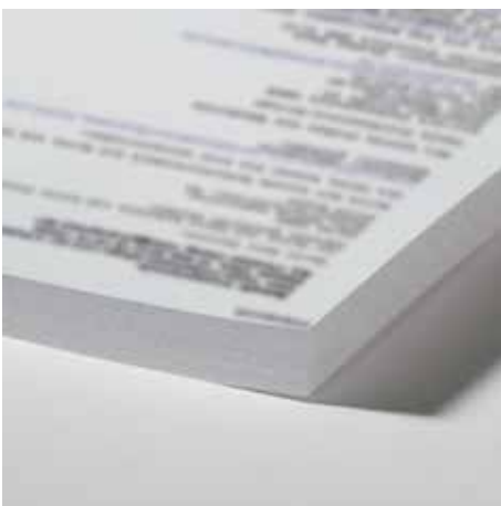
High shredding capacity makes easy work of shredding larger quantities of paper in one go