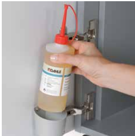
Environmentally friendly oil is always easy to access, included with all cross-cut models