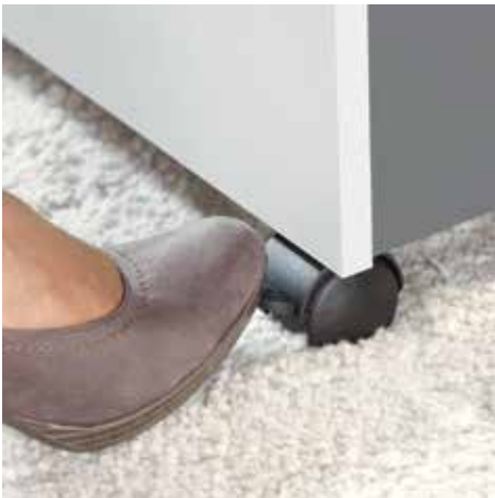
Convenient swivel casters providing 5 cm floor clearance for greater mobility and two brakes for reliably keeping the shredder firmly in place at the point of use