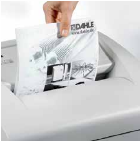
Standardised entry widths take all common paper sizes