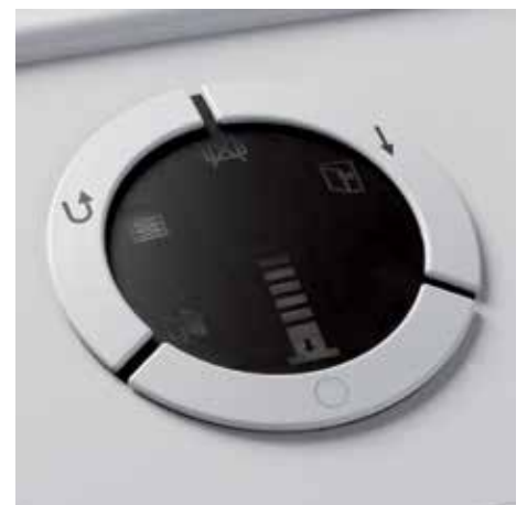
Clearly designed, user-friendly control panel permits easy, self-explanatory operation with illuminated symbols and acoustic signals