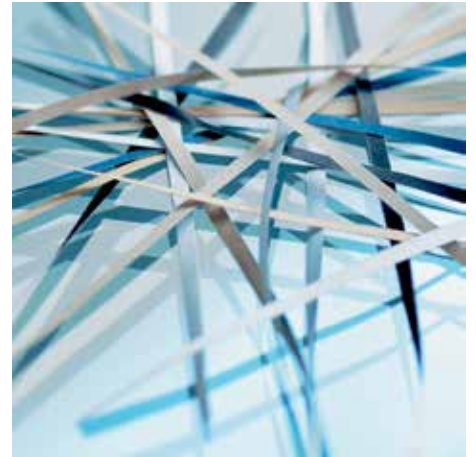
P-2 security: recommended, for example, for data media containing internal data that are to be made illegible