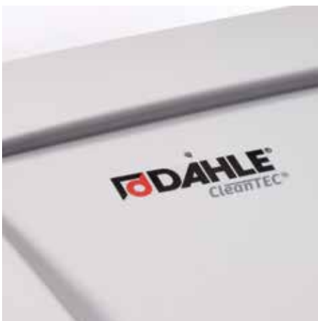
Automatic acoustic shut-down system with integrated microphone immediately stops the document shredder in an emergency in response to a call for help or knocks to the casing,