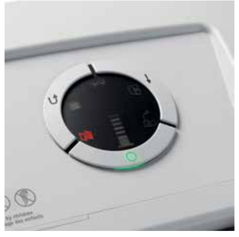
Clearly structured, user-friendly control panel indicates when the fine dust filter needs changing