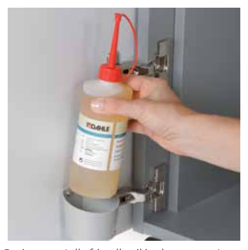
Environmentally friendly oil is always easy to access, included with all cross-cut models