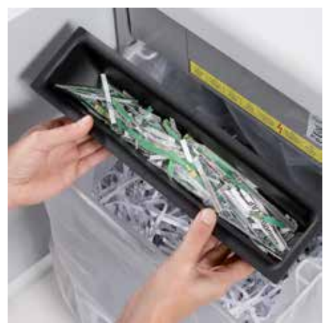
Separate, integrated waste boxes help to sort shredded paper, CDs, DVDs, cheque and credit cards for eco-friendly recycling