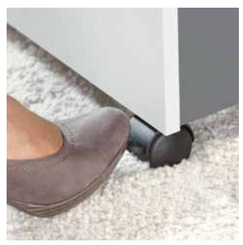
Convenient swivel casters providing 5 cm floor clearance for greater mobility and two brakes for reliably keeping the shredder firmly in place at the point of use