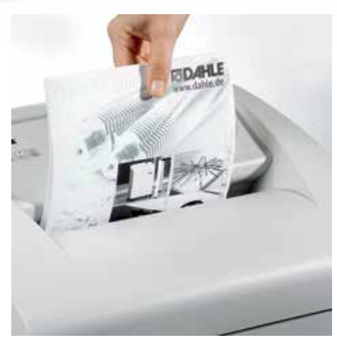
Standardised entry widths take all common paper sizes