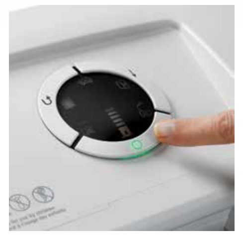
Clearly designed, user-friendly control panel permits easy, self-explanatory operation with illuminated symbols and acoustic signals