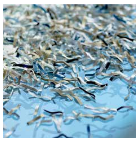
P-5 security: recommended, for example, for data media containing secret data