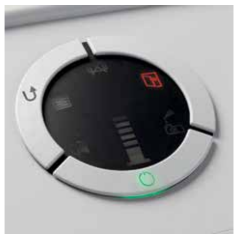
Visual and acoustic signal indicates open door