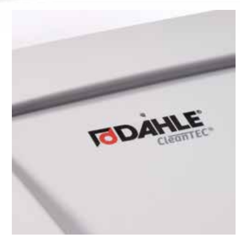
Automatic acoustic shut-down system with integrated microphone immediately stops the document shredder in an emergency in response to a call for help or knocks to the casing,