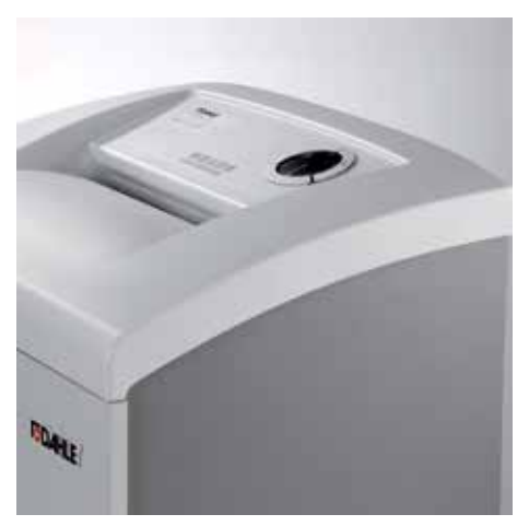
Modern design blends into any working environment.