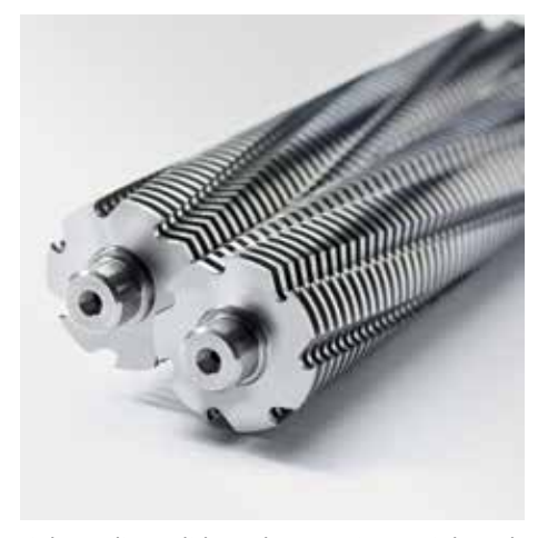
High-quality, solid-steel cutters in special steel for a guaranteed long service life