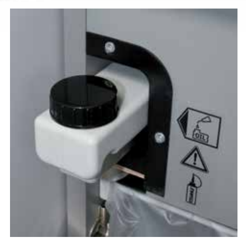
Integrated oil tank for controlled, automatic lubrication of the cross-cut cutters helps to lengthen service life while keeping performance constant