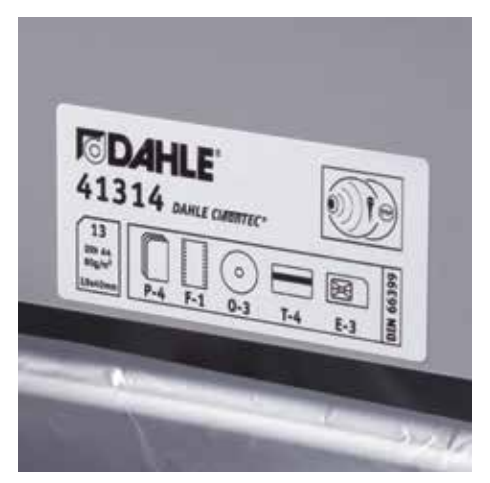
Clearly labelled performance characteristics on the top of the shredder help to ensure correct document shredder operation