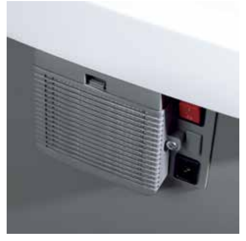
Unique DAHLE CleanTEC® filter system filters and effectively binds fine dust particles to create a better indoor environment.