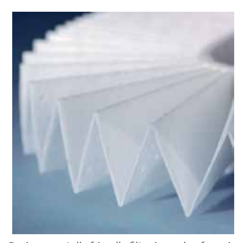
Environmentally friendly filter is made of special 3-ply, fully recyclable non-woven material