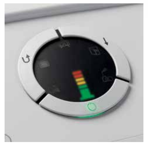
Paper quantity sensors prevent the document shredder from starting if too much has been fed in to avoid paper jams