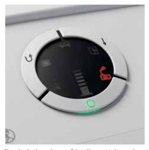
Clearly designed, user-friendly control panel signals oil refill