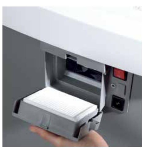
Environmentally-friendly filter is easy to change. A signal on the user-friendly control panel indicates when the fine dust filter needs changing