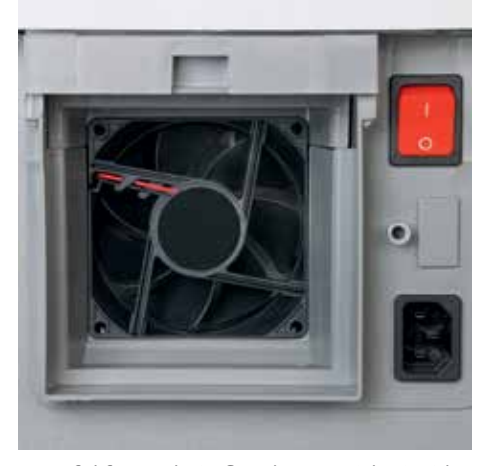
Powerful fan sucks in fine dust particles inside the document shredder and feeds them to the filter