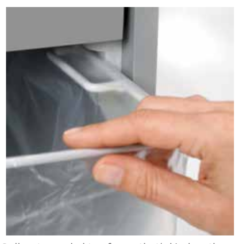
Pull-out rounded top frame that's kind on the fingers when changing the waste bag