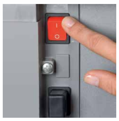
Separate main switch is located on the rear of the document shredder and completely disconnects it from the mains power supply