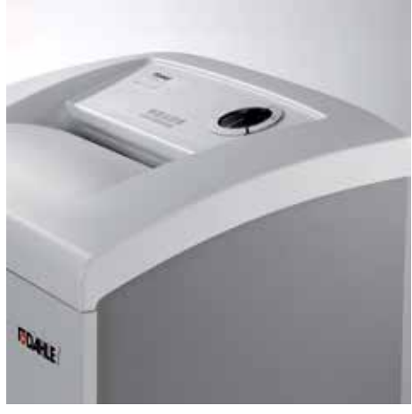
Modern design blends into any working environment.