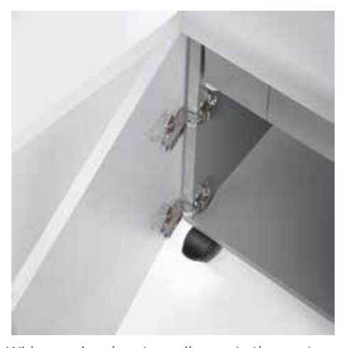
Wide opening door to easily empty the waste bag