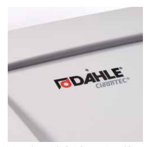
Automatic acoustic shut-down system with integrated microphone immediately stops the document shredder in an emergency in response to a call for help or knocks to the casing,