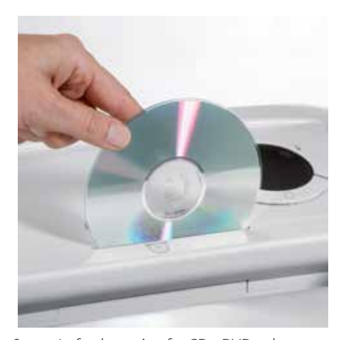
Separate feed opening for CDs, DVDs, cheque and credit cards guarantees reliable shredding of optical, magnetic and/or electronic data carriers