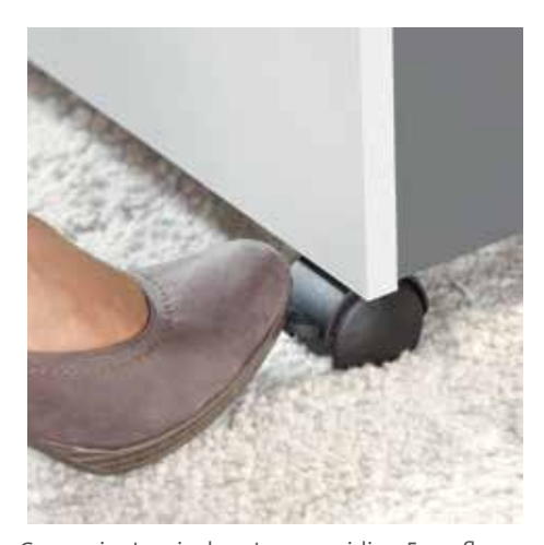
Convenient swivel casters providing 5 cm floor clearance for greater mobility and two brakes for reliably keeping the shredder firmly in place at the point of use