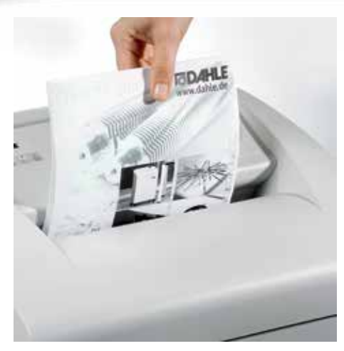
Standardised entry widths take all common paper sizes