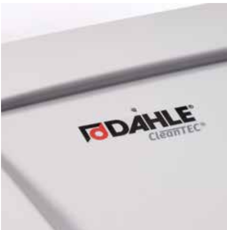
Automatic acoustic shut-down system with integrated microphone immediately stops the document shredder in an emergency in response to a call for help or knocks to the casing,