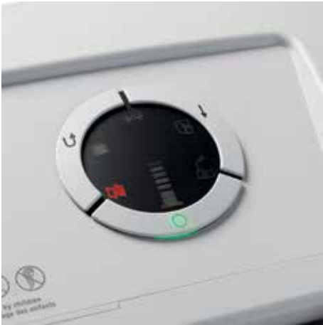
Clearly structured, user-friendly control panel indicates when the fine dust filter needs changing