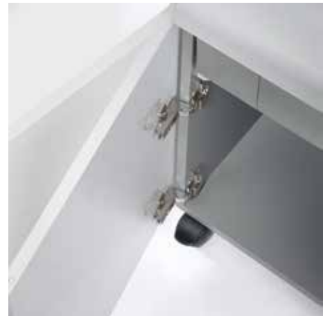
Wide opening door to easily empty the waste bag