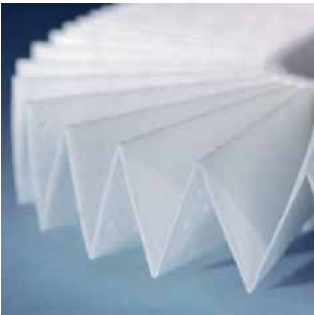
Environmentally friendly filter is made of special 3-ply, fully recyclable non-woven material