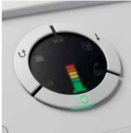
Paper quantity sensors prevent the document shredder from starting if too much has been fed in to avoid paper jams