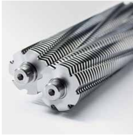
High-quality, solid-steel cutters in special steel for a guaranteed long service life