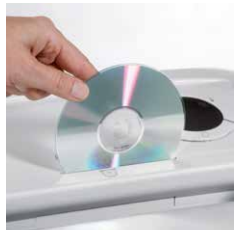
Separate feed opening for CDs, DVDs, cheque and credit cards guarantees reliable shredding of optical, magnetic and/or electronic data carriers