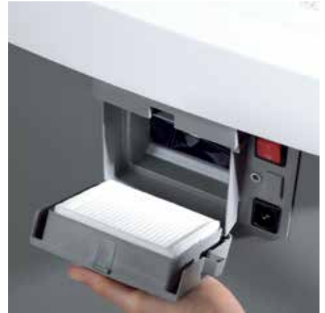
Environmentally-friendly filter is easy to change. A signal on the user-friendly control panel indicates when the fine dust filter needs changing