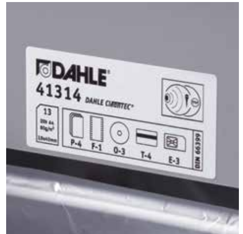
Clearly labelled performance characteristics on the top of the shredder help to ensure correct document shredder operation