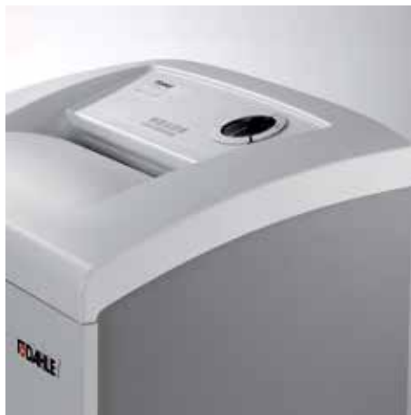
Modern design blends into any working environment.