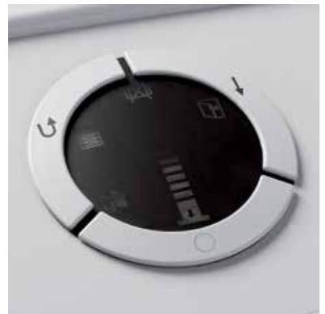
Clearly designed, user-friendly control panel permits easy, self-explanatory operation with illuminated symbols and acoustic signals