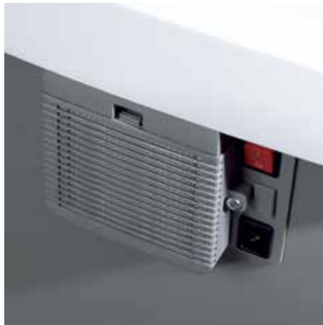
Unique DAHLE CleanTEC® filter system filters and effectively binds fine dust particles to create a better indoor environment.