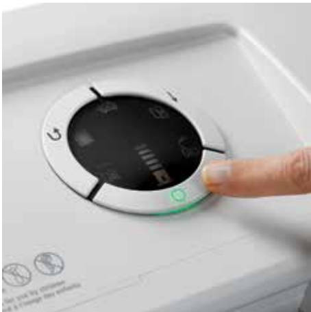
Clearly designed, user-friendly control panel permits easy, self-explanatory operation with illuminated symbols and acoustic signals