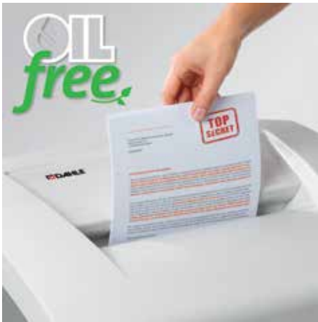
Shredding the convenient way, all without the time-consuming process of oiling the cutters