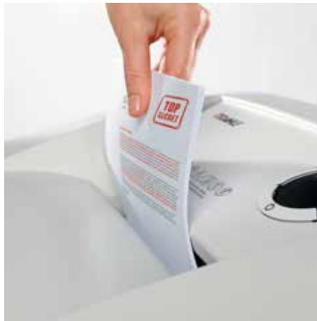
Innovative MHP technology® shreds up to 30 % more paper