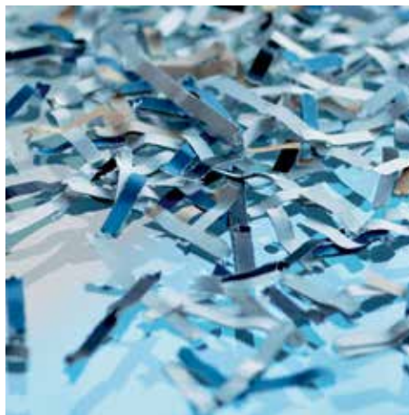
P-4 security: recommended, for example, for data media containing particularly sensitive, confidential and personal data