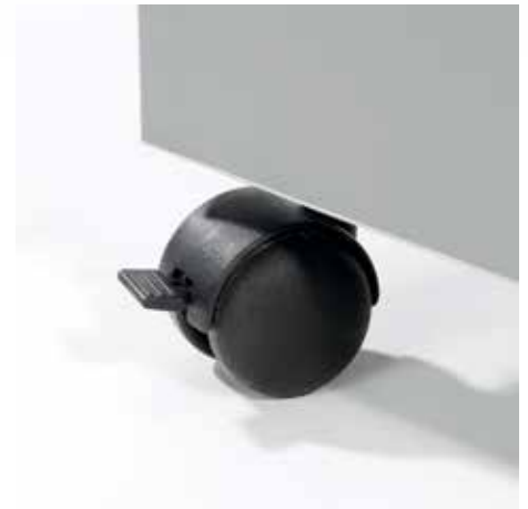
Practical swivel casters for flexible use