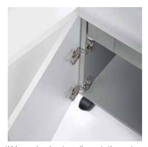
Wide opening door to easily empty the waste bag