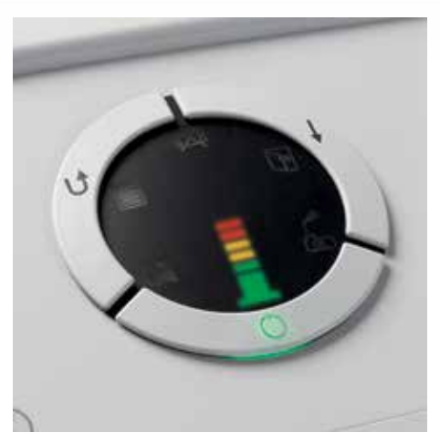
Paper quantity sensors prevent the document shredder from starting if too much has been fed in to avoid paper jams