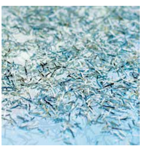
P-6 security: recommended for data media containing secret data demanding exceptionally stringent security measures