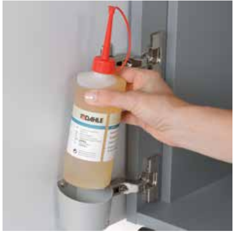
Environmentally friendly oil is always easy to access, included with all cross-cut models