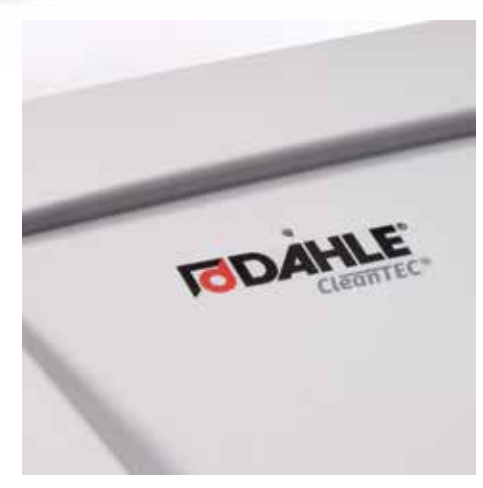
Automatic acoustic shut-down system with integrated microphone immediately stops the document shredder in an emergency in response to a call for help or knocks to the casing,