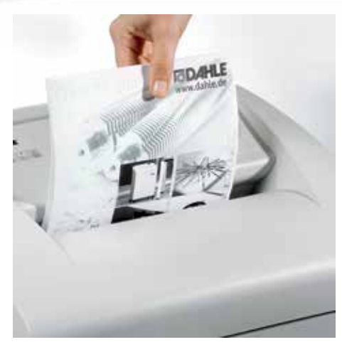
Standardised entry widths take all common paper sizes