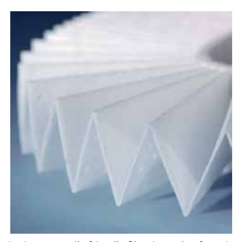
Environmentally friendly filter is made of special 3-ply, fully recyclable non-woven material