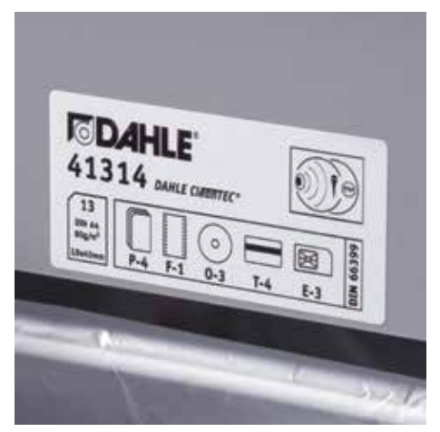
Clearly labelled performance characteristics on the top of the shredder help to ensure correct document shredder operation